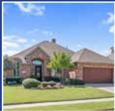
343 Pine Valley 3 bedroom + study - K-Hovonian