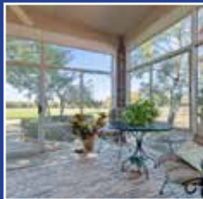
517 Bridle Court Golf Course Lot - Magnificent Sunset Views