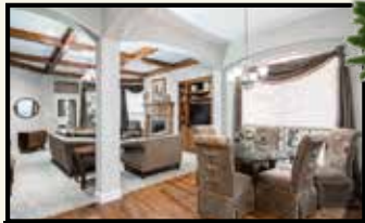
728 PELICAN HILLS DR