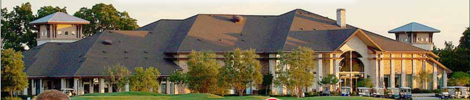
Heritage Ranch Clubhouse

THE REAL ESTATE MARKET IS CHANGING... EXPERIENCE MAKES A DIFFERENCE! GIVE ME A CALL TO FIND OUT MORE!