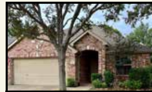
924 CASCADE DRIVE