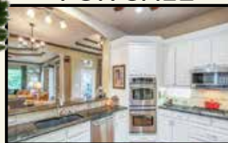
1008 SHOAL CREEK CT