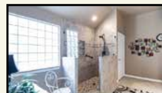
1375 RANCH HOUSE DR