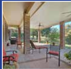
441 Black Diamond Views of 15th Fairway from oversized lot