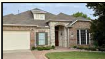
375 SOUTHERN HILLS DR