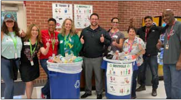
Pictured above: Lovejoy Green Team rolling out new cafeteria recycling program at Lovejoy High School