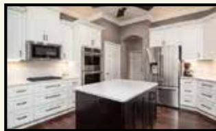
904 QUARRY OAKS DR