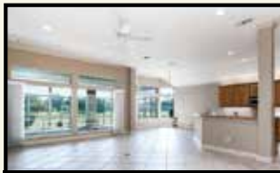
368 PINE VALLEY DR