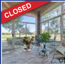
517 Bridle Court Golf Course Lot - Magnificent Sunset Views