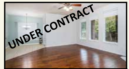
436 BLACK DIAMOND CT