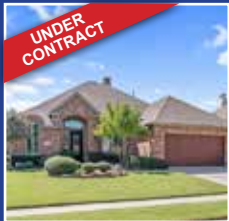
343 Pine Valley 3 bedroom + study - K-Hovanian