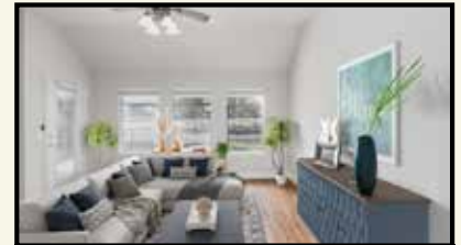
1304 SHINNECOCK (VILLA)