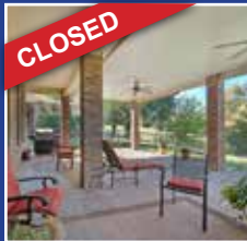
441 Black Diamond Views of 15th Fairway from oversized lot