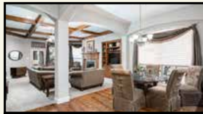
728 PELICAN HILLS DR