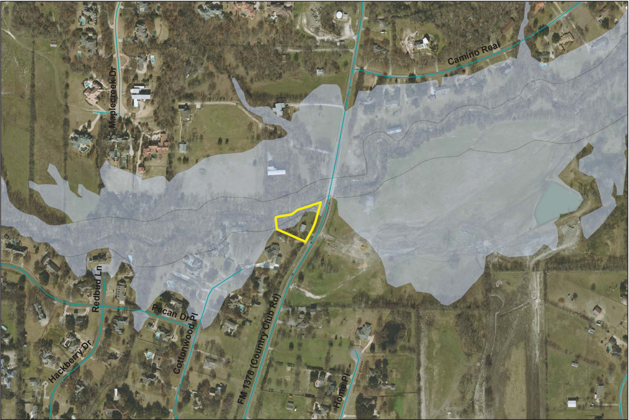
0.811-acres Abstract A791, Samuel Sloan Survey, Sheet 2, Tract 100