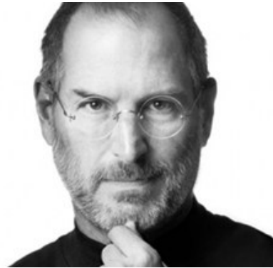
Steve Jobs 1955-2011

October, 5, 2011, will always be remembered as the day “Apple [had] lost a visionary and creative genius, and the world [had] lost an amazing human being” (Apple.com). Steve Jobs transformed the technology world into what it is today and has raised the bar on consumer expectations. He revolutionized the way people use technology with the iPod, iPad, iPhone, Macintosh computers, and changed the music industry forever with the invention of the iTunes Music Store.