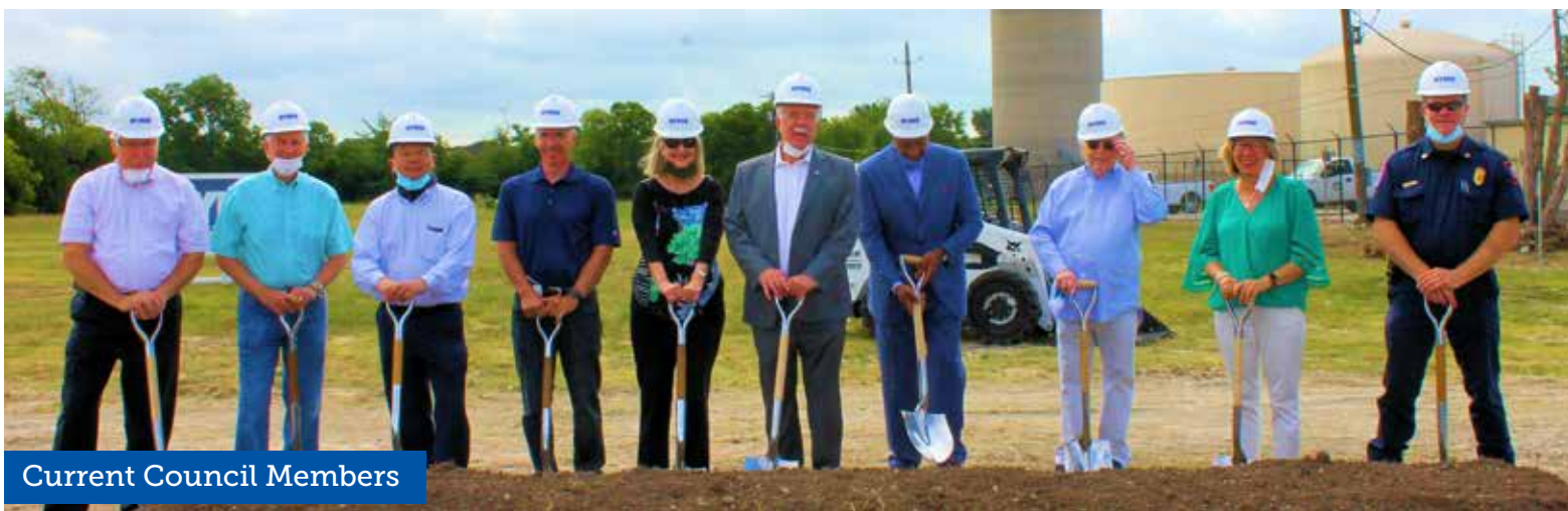
Current Council Members