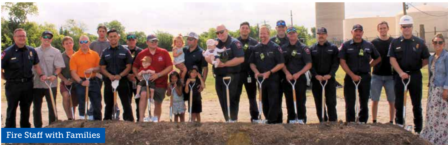
Fire Staff with Families