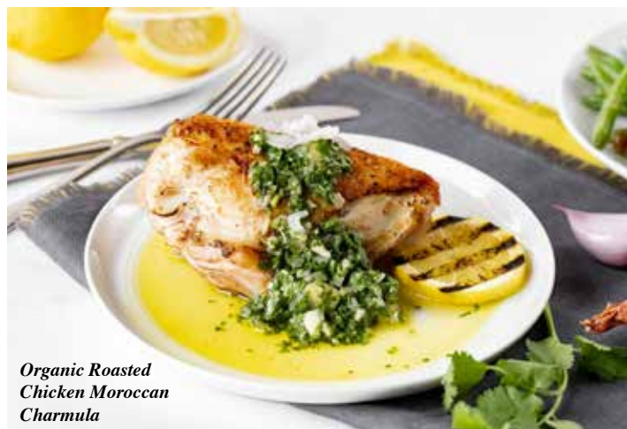
Organic Roasted Chicken Moroccan Charmula